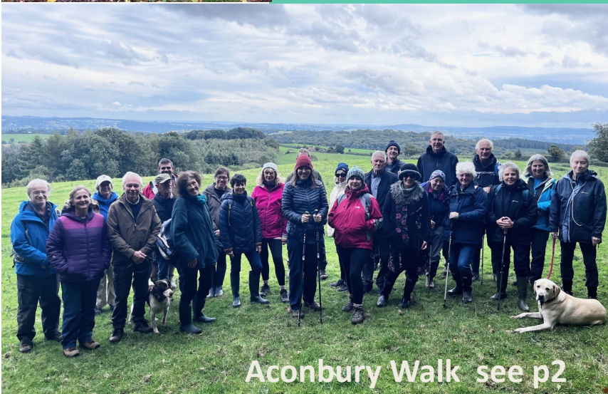
Aconbury Walk see p2